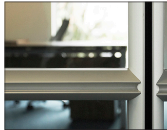
Everything about health