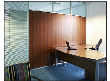
Everything about privacy

QB-SPACE. A single system with many outcomes. Formed around a peerless, aluminium framework and surrounded by the highest quality and finish. Curve it, shape it, make it private or collaborative. Configure and reconfigure to suit any environment and to enhance any space, minimising your footprint at the same time. It's a winning solution, whichever way you look at it.